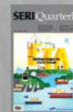
July 2011 Building Bridges for Future Growth