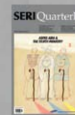
October 2011 Aging Asia & the Silver Industry