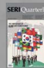
October 2010 The Emergence of G20 and Korea's Role