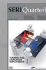
January 2011 Tensions Rise, Unification Hopes Remain