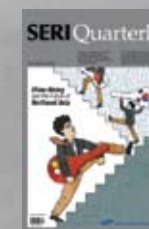
April 2011 China Rising and the Future of Northeast Asia