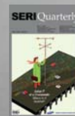
January 2012 Asian IT at a Crossroads: Where is it headed?