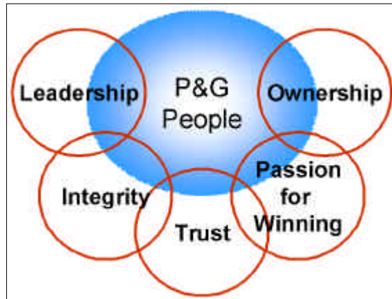
< 3> P&G 가 (Core Value)